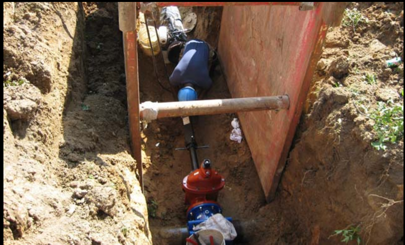
Live Tap at Existing Main